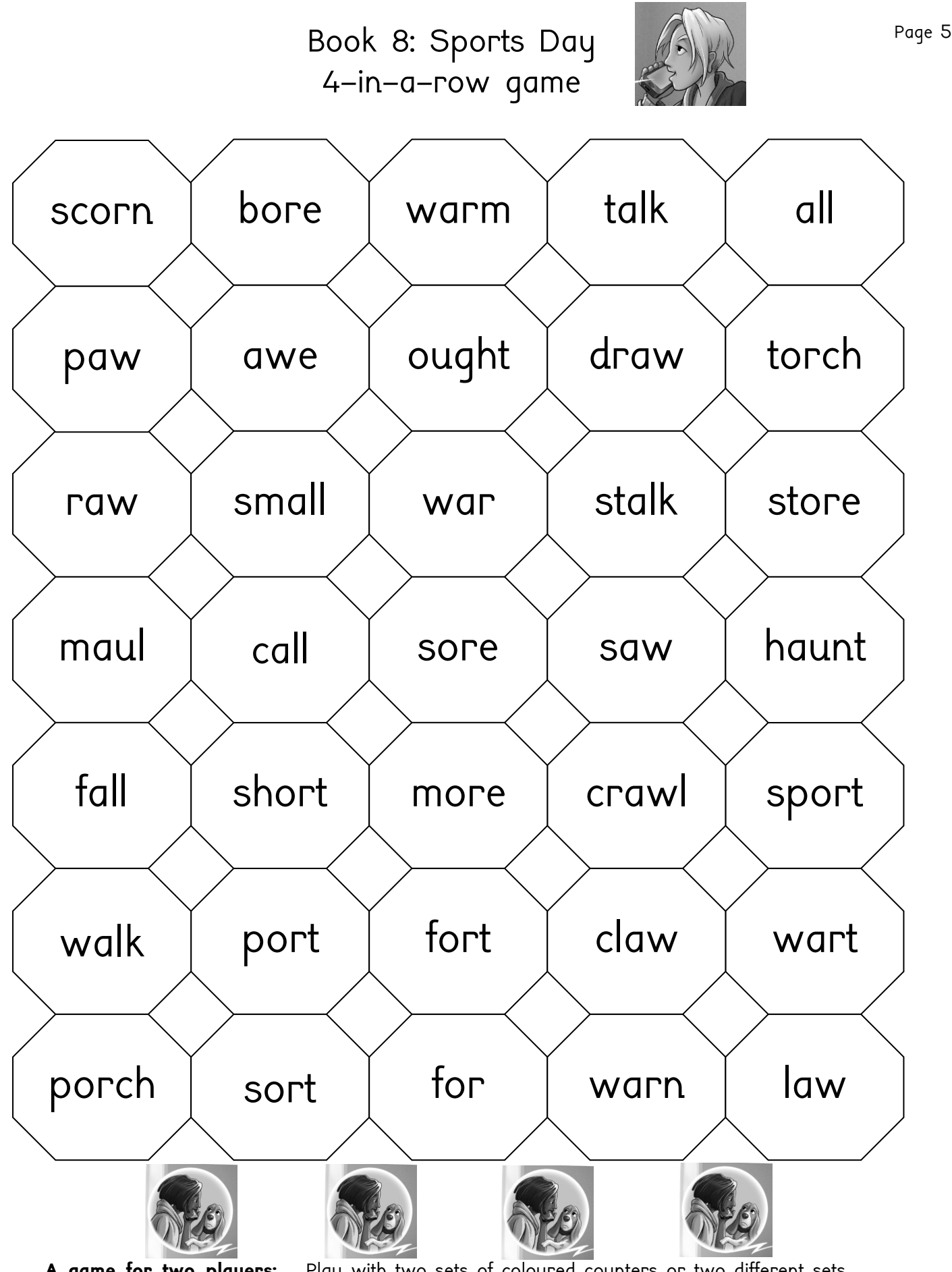
A game for two players: Play with two sets of coloured counters or two different sets of coins. Players take turns to read a word and put a counter on it. The winner is the first to get four of his or her counters in a row in any direction. The winner places a counter on a picture of Liz. The game is played four times until all the pictures of Liz are covered.