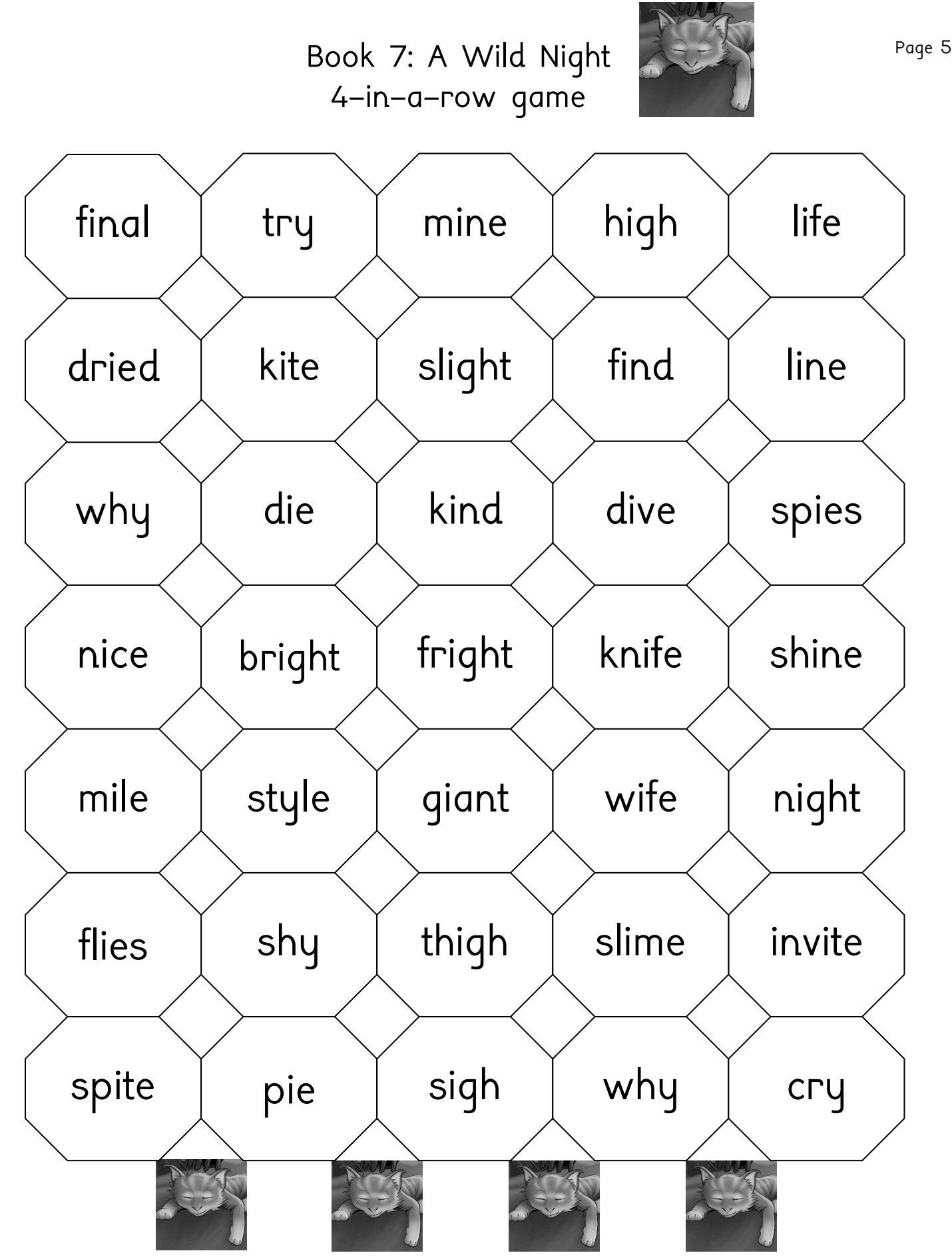
A game for two players: Play with two sets of coloured counters or two different sets of coins. Players take turns to read a word and put a counter on it. The winner is the first to get four of his or her counters in a row in any direction. The winner places a counter on a picture of the cat. The game is played four times until all the pictures of the cat are covered.