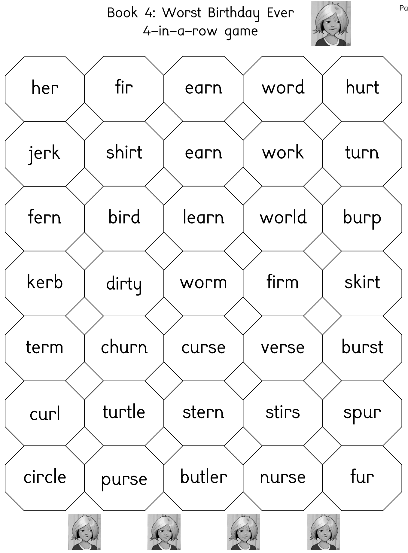
A game for two players: Play with two sets of coloured counters or two different sets of coins. Players take turns to read a word and put a counter on it. The winner is the first to get four of his or her counters in a row in any direction. The winner places a counter on a picture of Bella. The game is played four times until all the pictures of Bella are covered.