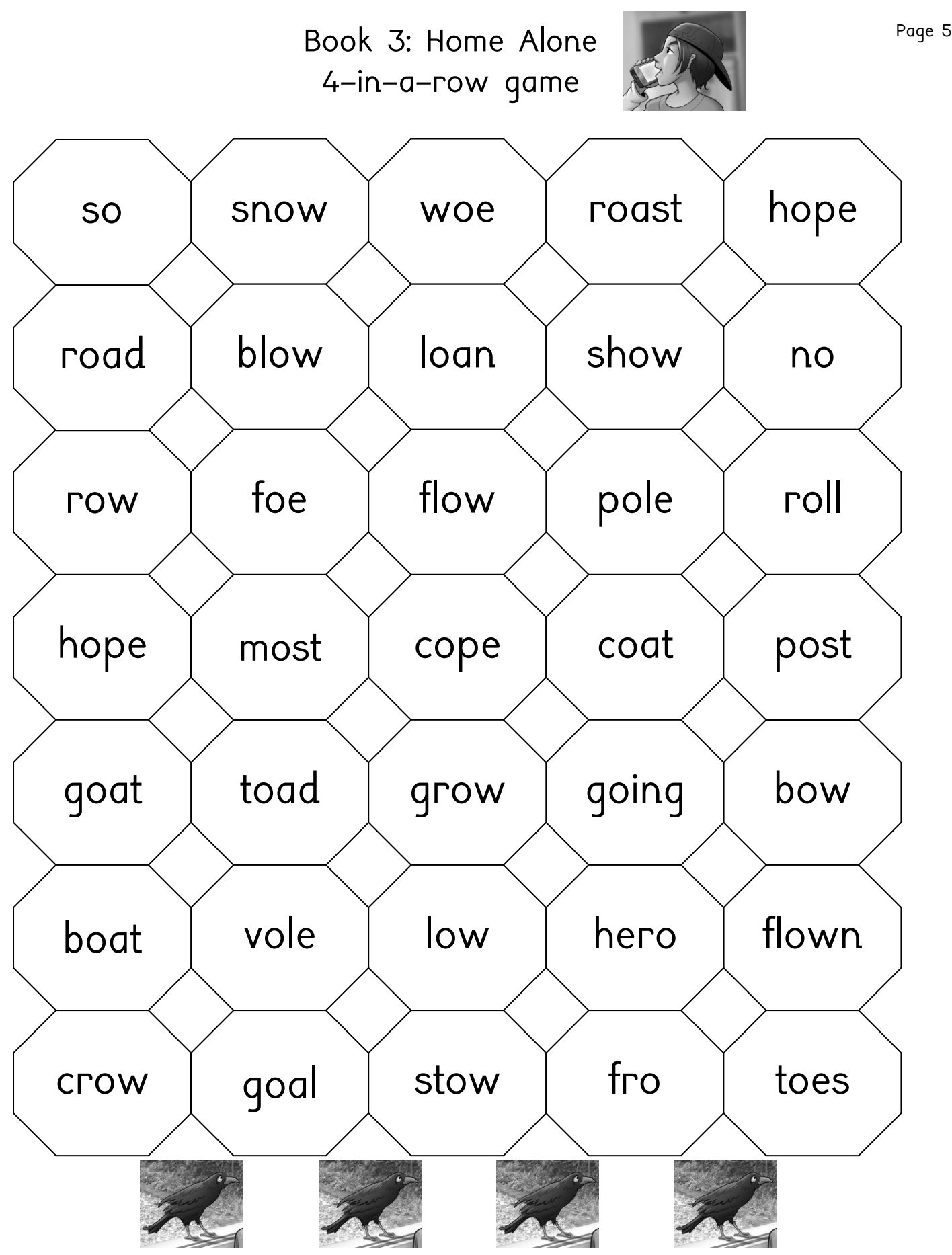
A game for two players: Play with two sets of coloured counters or two different sets of coins. Players take turns to read a word and put a counter on it. The winner is the first to get four of his or her counters in a row in any direction. The winner places a counter on a picture of a crow. The game is played four times until all the pictures of the crow are covered.